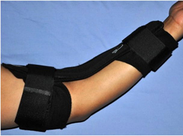
FIGURE 1: Hely & Weber orthosis used in this investigation. The orthosis can be adjusted to keep the elbow at 45° of flexion.

time aggravation of the ulnar nerve (Appendix A; available on the Journal's Web site at www.jhandsurg.org ).